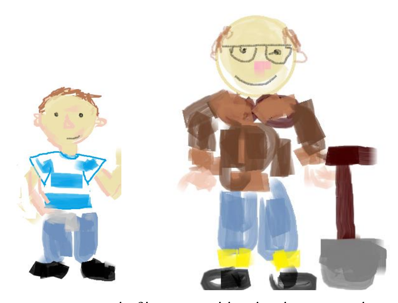
Grandpa was very proud of his Vegetables that he grew in his garden